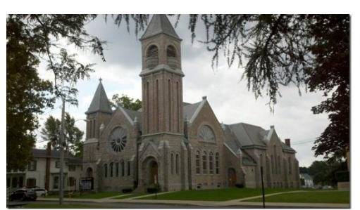
"We are a church for all seasons journeying together, going faith forward, and experiencing the Light of God."

LeRoy United Methodist Church, Inc. 10 Trigon Park LeRoy, NY 14482